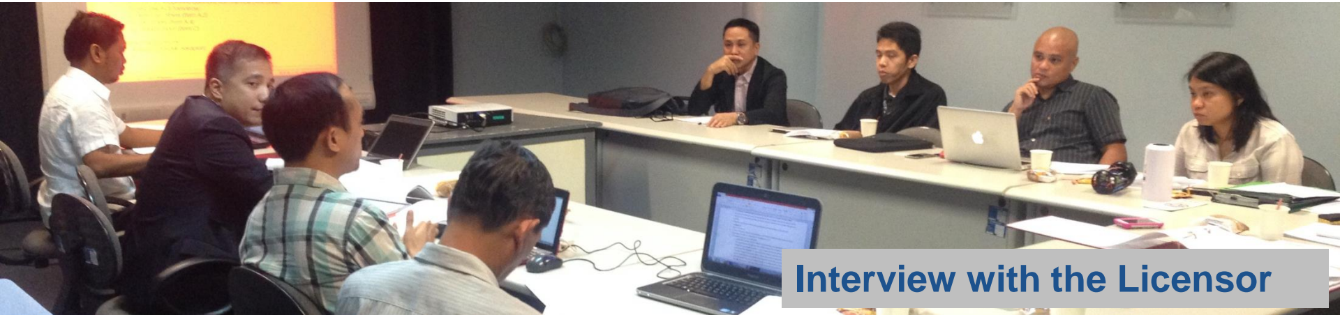
Interview with the Licensor