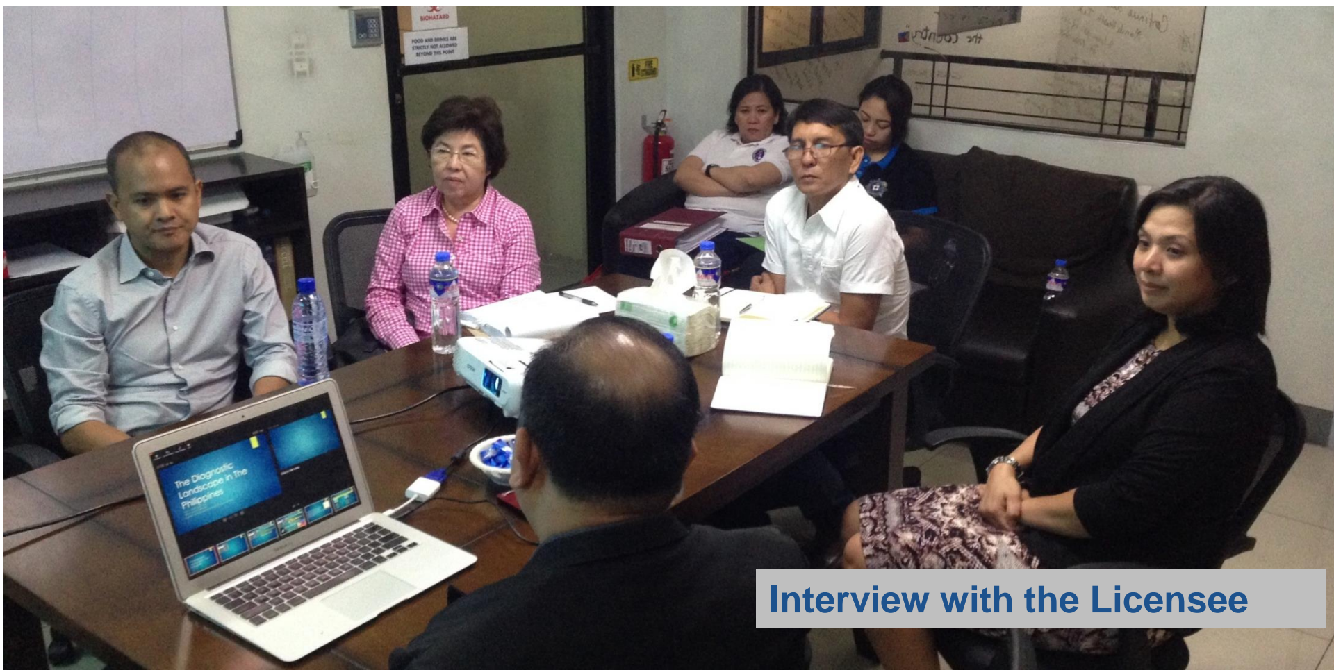
Interview with the Licensee