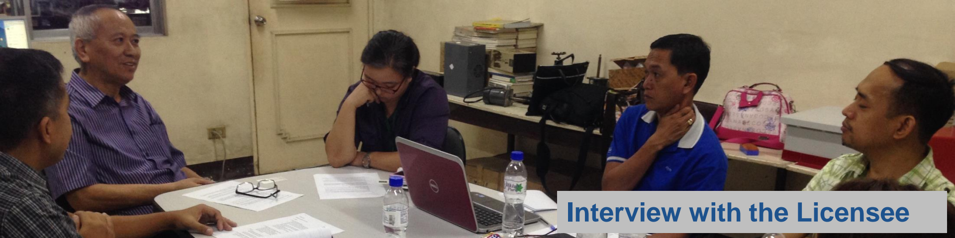
Interview with the Licensee