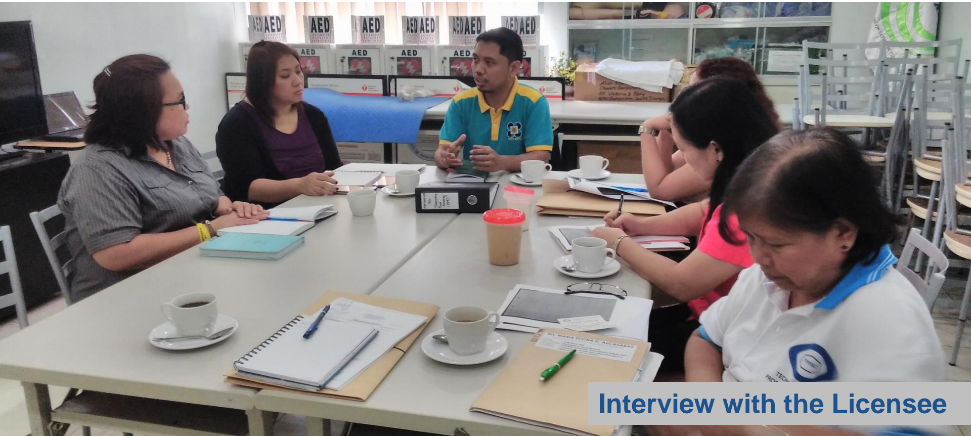
Interview with the Licensee